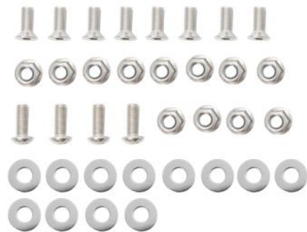
Bolt & Nut & Washer