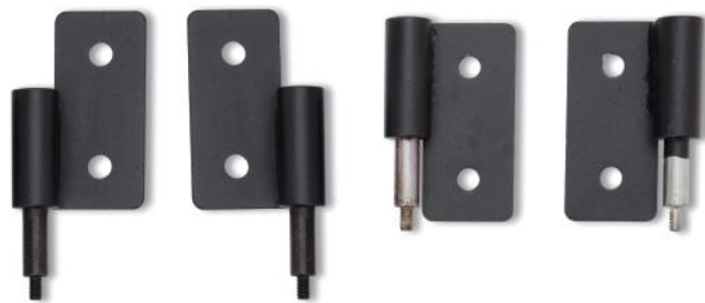
Long Hinge Short Hinge

Installation Manual: for Jeep Wranglers 2007 - 2018 JK