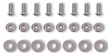
Bolt & Nut & Washer